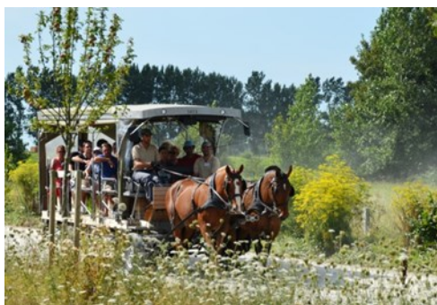
Photo 26. Carriage horses used in tourism.

Horses are used in connection with tourism in different ways. This may be horse trekking, including carrying tourists to sites of interest with or without a guide, or as carriage horses to drive tourists on sight-seeing tours, use as different kinds of pet-animals etc.