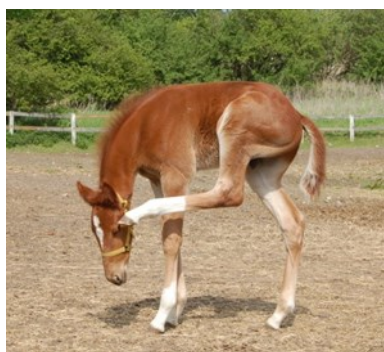
Photo 5. Scratching with a leg.