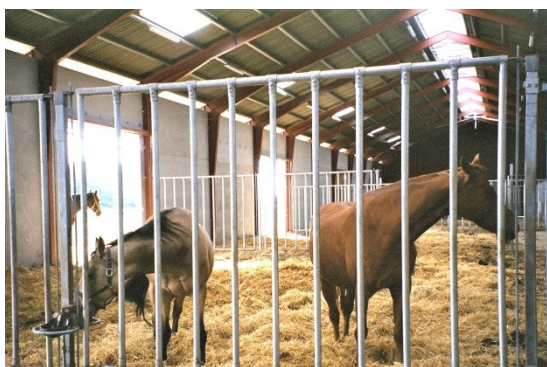
Photo 14. Horses in a group housing system with access to an outside run.

In group housing systems the total floor area should allow free movement, sufficient access and space at feeding and watering stations, and ensure a dry bedded area large enough to allow all horses to lie down undisturbed at the same time. Fittings to allow temporary tethering of horses, for example when a concentrate ration is fed, should be considered. Care should be taken to select groups of horses that are compatible. Ill or injured horses or horses with deviating behavior (for example aggressiveness) should be managed accordingly and group housing may not be suitable for such individuals. Facilities for temporary separation of individuals should always be available. The design of the group housing system should ensure that all horses are able to move away from each other and to access feed and water at any time. Dead-ends and sharp corners should be avoided to prevent horses from being trapped.