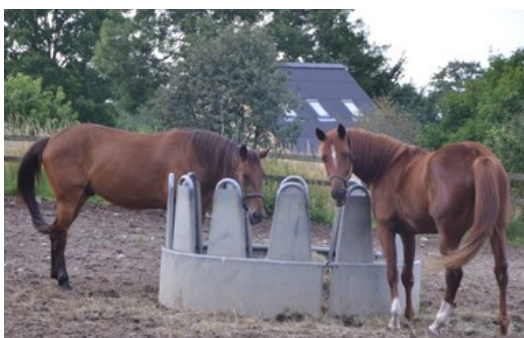
Photo 17. Horses should have access to roughage both when they are stabled and in paddocks without grass.

Chewing promotes production of saliva that acts to neutralise the continuous production of acid in the stomach. To prevent stomach ulcers and enhance gut health horses are dependent on near-continuous access to roughage.