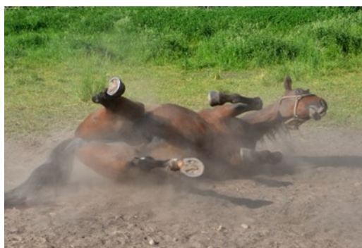
Photo 6. Rolling in sand.

Although horses are social animals, they have a social space, which defines the distance that they wish to keep from other horses. This distance is individual, and is dependent on age and on how well the horses know each other. During social grooming, for example, the distance is zero. Horses may also be seen standing close together when trying to keep insects away. Foals and young horses appear to have a very narrow or less developed social space and they may be seen lying close together. When horses are group housed, it is important to take social space into account when deciding how much space they should be given.