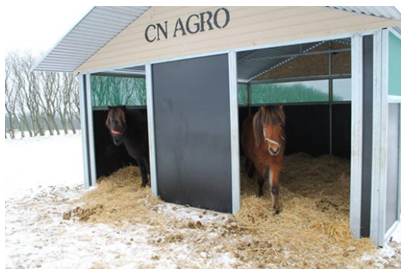
Photo 15. Shelter should be large enough to provide protection to all horses at the same time

Sufficient shelter may be provided by the natural surroundings, such as trees, hedges or other natural vegetation or by purpose-built shelters.