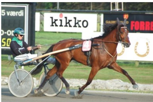
Photo 18. Some groups of horses may need to be supplemented with high energy feed.

Many horses can live on grass or roughage alone, supplemented with vitamins and minerals if necessary. Some groups such as sport horses, young, growing horses or horses meant for breeding purposes may have a need for a higher energy consumption due to their level of exercise or basic needs. Therefore, they may need to be supplemented with high energy feed (concentrate).