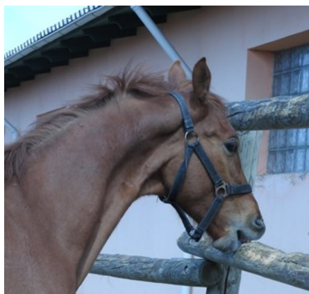
Photo 9. Crib biting may be performed on any suitable surface

Abnormal behaviours are seldom or never seen in horses that live under natural conditions. Abnormal behaviour is a sign that the environment and/or the conditions, in which horses are kept or have been kept, do not fulfil their needs. Permanent dysfunction of the central nervous system in response to stressful conditions may mean that developed stereotypies may not resolve despite later changes to the environment or conditions. Many abnormal behaviours are stereotypies such as crib biting, wind sucking, stable walking, weaving and auto-mutilation (e.g. biting themselves). Horses may also exhibit compromised welfare in subtler ways such as becoming apathetic and withdrawn.