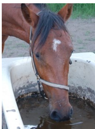
Photo 19. Horses prefer to drink from an open water surface

Horses prefer to drink from a water surface, but learn without difficulty to drink from a water cup. When automatic drinking systems are used, they should be checked daily and should have a water flow of approx. 8 liters per minute in order to ensure sufficient water intake.