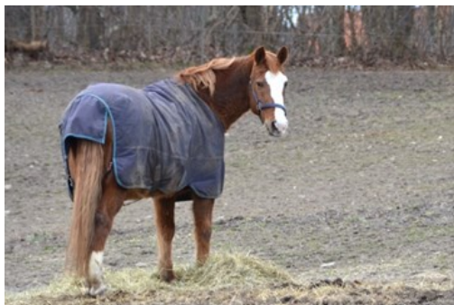
Photo 22. Horse with a winter rug

During cold winter months, waterproof and breathable turnout rugs may be used to protect horses from adverse weather conditions.