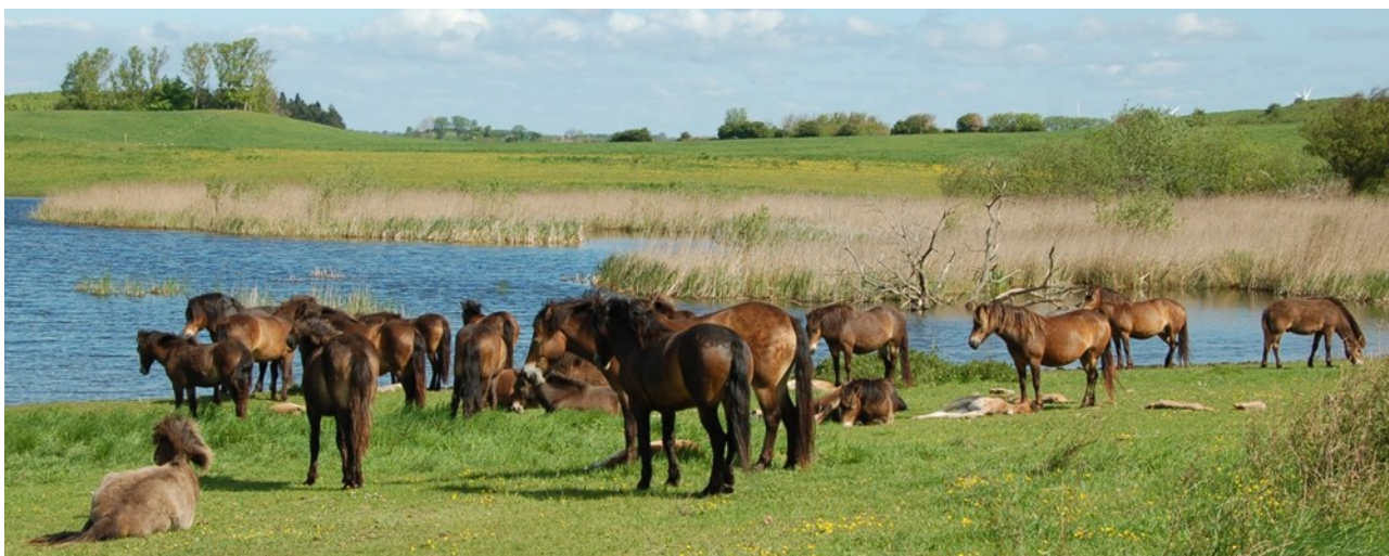
Photo 1. Knowledge on the natural behaviour of horses derives mainly from studies of feral horses.

Today’s domestic horse, the Przewalski’s horse and other feral or wild horses such as the now extinct tarpan, share a common ancestor. Knowledge on natural horse behaviour derives partly from studies on Przewalski’s horses reintroduced to their original habitat, but mainly from studies of feral horses - offspring of escaped domestic horses that live under natural or semi natural conditions with no or little human interference.