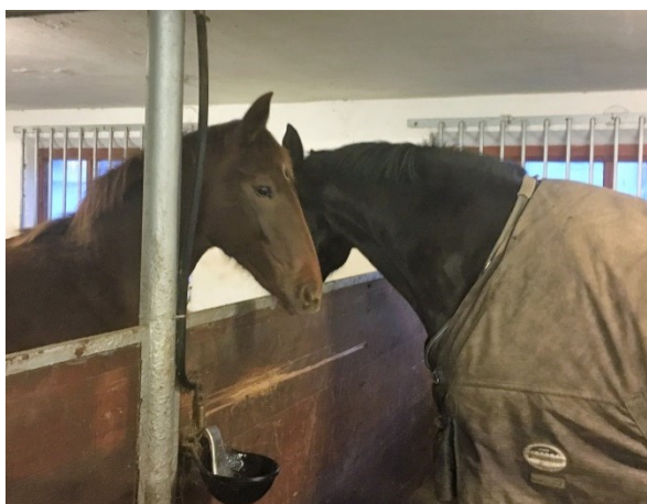
Photo 12. Individual boxes, which allows horses to touch each other.

Individual (loose) boxes should be dimensioned to fit the size of the horse, so that the horse can lie down in a natural lateral position (see photo 8), turn around and get up unimpeded, and stand in a natural position. Boxes for foaling or boxes for a mare with foal at foot need to be larger than boxes for single horses. When considering space requirements, the time the horse spends in the box should be taken into account. The box should be larger if the horse is stabled for a major part of the day. The upper part of partitions between boxes should not be solid, but allow horses in neighboring boxes to see each other and allow for adequate ventilation. Fittings, such as feeding and watering equipment, should be positioned, designed, and maintained in a way as to avoid injury to the horse, and as far as possible avoid contamination with urine and faeces.