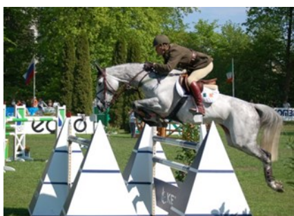
Photo 24. Show jumping.

Most sports organisations (racing, riding, driving etc.) have standards or codes of conduct, which aims to help ensure the welfare of horses while they are taking part in competitions.