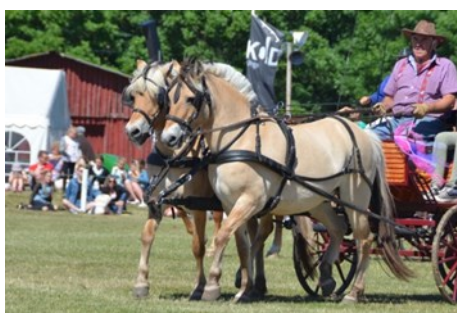
Photo 25. Driving.

This may include rules on what equipment and tack can be used (for example whip and spurs), on training and correction methods during warming-up and competition, on when pregnant mares can no longer compete or race, on use of equipment as a coercive measure, and on illegal substances or methods (doping).