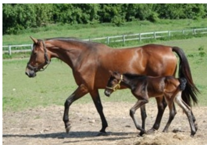
Photo 29 and 30. Foals should drink colostrum within a few hours after birth, and they should be given time in a paddock or on pasture from day one.

Colostrum protects the foal from possible disease agents in the environment. It is therefore vital that the foal drinks milk from the mare within a few hours of birth. If this isn't possible, for example due to a problem with the mare, then veterinary advice should be sought without delay.