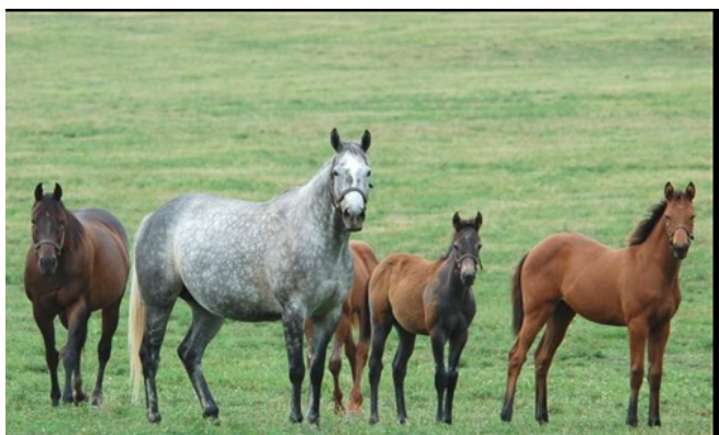
Photo 16. It is recommended that horses are given daily access to a paddock or pasture, where possible with other horses.

It is recommended that all horses should be given daily access to paddocks or pasture, where possible together with other horses, in order to fulfill their need for free movement and social contact. However, there may be situations where veterinary advice or extreme weather conditions make this contradictory.