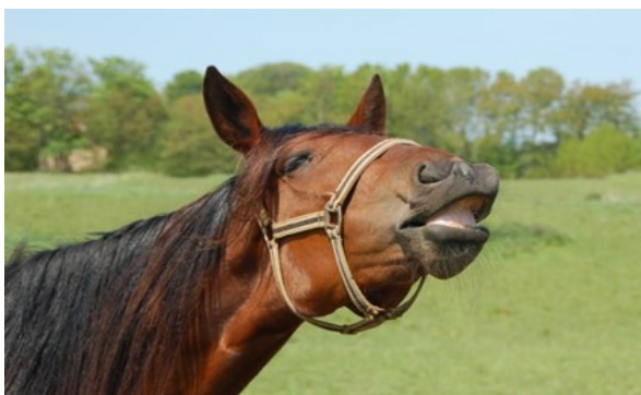
Photo 3: Flehmen enables the horse to investigate a scent more closely

Horses are gregarious/herd animals. Under natural conditions horses live close together in stable groups. The groups typically consist of one, or sometimes more than one, adult stallion and a number of mares with offspring, including young males. Young stallions and older stallions without a group of mares also group together. The group stabilises itself with a social order, which is challenged when new members are introduced. A new social order is typically formed within a few days to weeks. Living in stable groups has a number of advantages, mainly in relation to social transmission of behaviour, seeking feed and water, and a defence strategy to avoid or minimize encounters with predators. As an example, all horses of a group rarely lie down together. One will remain standing and guard the group. Horses will generally become anxious and insecure when isolated from other horses. In domestic horses, lack of social contact both early and later in life may cause development of abnormal behaviour such as weaving in stabled horses, or more aggressive interactions when on pasture with other horses. Furthermore, group housed young horses are easier to handle and train than young horses kept individually.