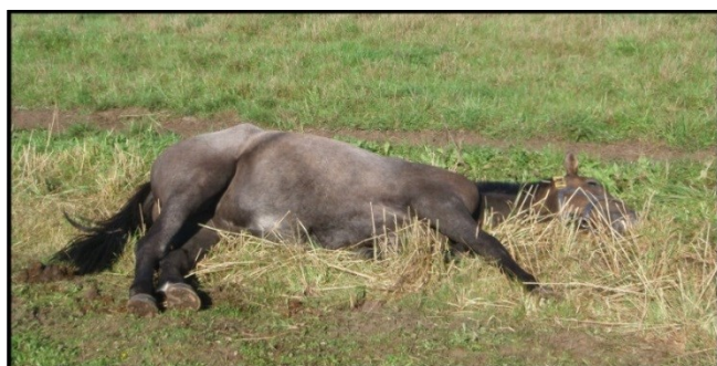
Photo 8. Horses need to lie flat on their side to enter deep sleep. The natural position is to extend the legs, neck and head.

Horses have different phases of sleep. In particular, horses require a phase of sleep during every 24-hour period where they are lying down on their sides with their limbs extended and their muscles relaxed. To achieve this they need to feel safe, have enough space and a dry lying area. It is important to keep this in mind for the size and type of accommodation for horses.