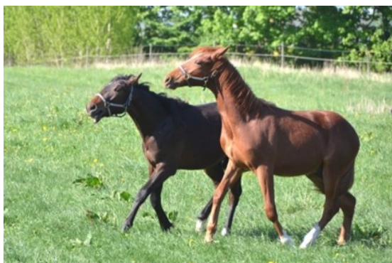
Photo 10. Social contact is important for horses.

As mentioned above, horses are gregarious animals, and lack of social contact with other horses both early and later in life may cause development of different abnormal behaviours and lack of development of normal social behaviour. Horses prefer full physical direct contact in paddocks, on pasture or in group housing.