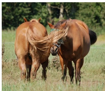
Photo 7. Horses standing close to keep insects away from each other's head.

Although horses are social animals, they have a social space, which defines the distance that they wish to keep from other horses. This distance is individual, and is dependent on age and on how well the horses know each other. During social grooming, for example, the distance is zero. Horses may also be seen standing close together when trying to keep insects away. Foals and young horses appear to have a very narrow or less developed social space and they may be seen lying close together. When horses are group housed, it is important to take social space into account when deciding how much space they should be given.