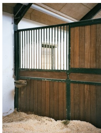
Photo 13. Individual boxes, which allow horses to see each other.