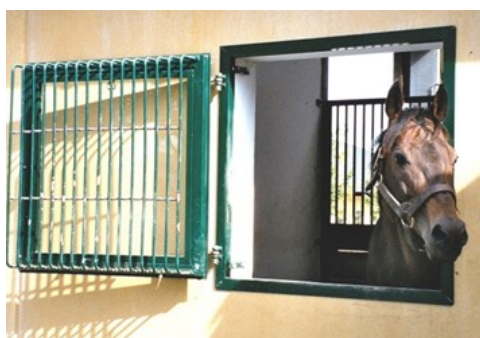
Photo 11. Window with a grid.

Windows in accommodation for horses should be made of unbreakable glass or be protected by an appropriately constructed grid or the like to prevent horses from breaking the glass and injuring themselves.