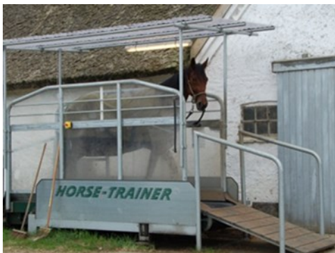
Photo 21. Horses should be supervised by a competent person at all times when exercised on a treadmill

Mechanical equipment such as horse walkers and treadmills are used for exercising horses.