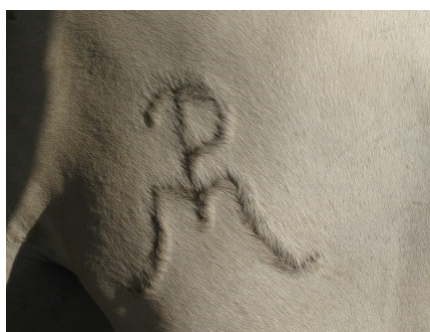
Photo 27 and 28. Tail docking and hot iron branding should be strongly discouraged.