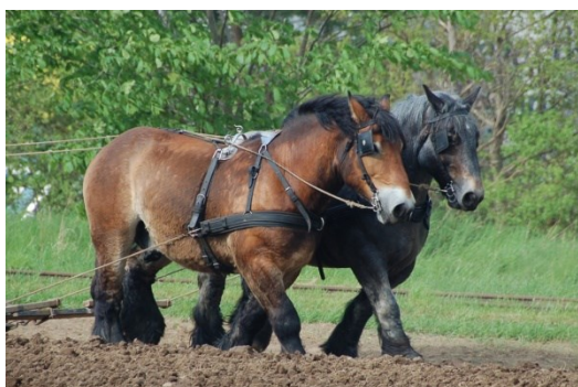
Photo 23. Working horses used for agricultural purposes.

As with any other horses their basic needs have to be fulfilled and capability of workload considered. Please refer to chapter 7.12 on welfare of working equids in the OIE Terrestrial Animal Health Code for detailed consideration of the working horse welfare needs.