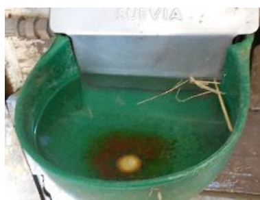
Photo 20. Water cups should be checked daily for cleanliness and functionality